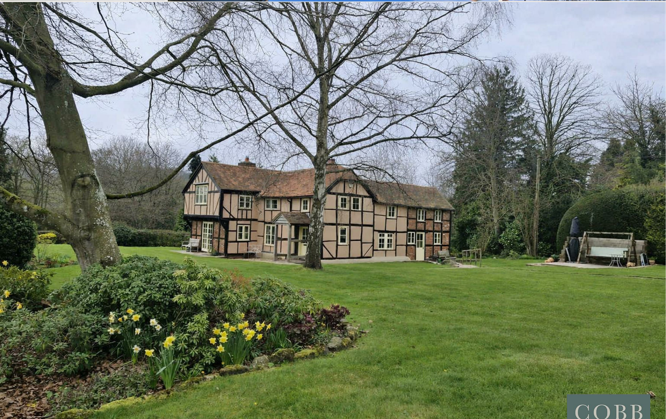
Westmoor Cottage, Mansel Lacy, Hereford, HR4 7HN Price £865,000